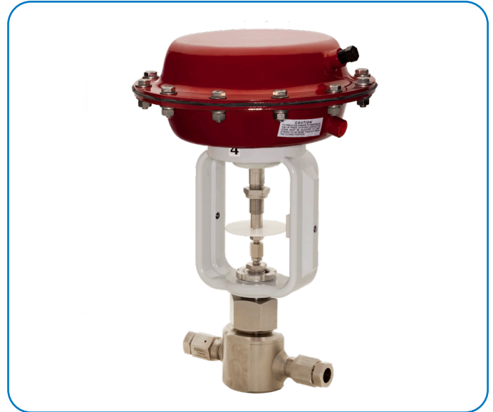
Type 1711HD Valve