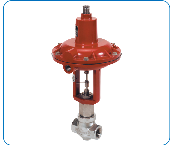
Shown with Type 754 Actuator