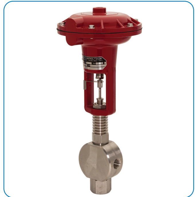
Shown with type 755 actuator