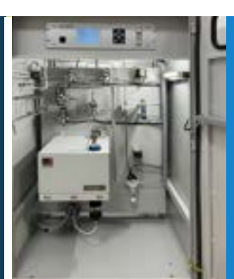
Online Continuous Emission Monitoring System