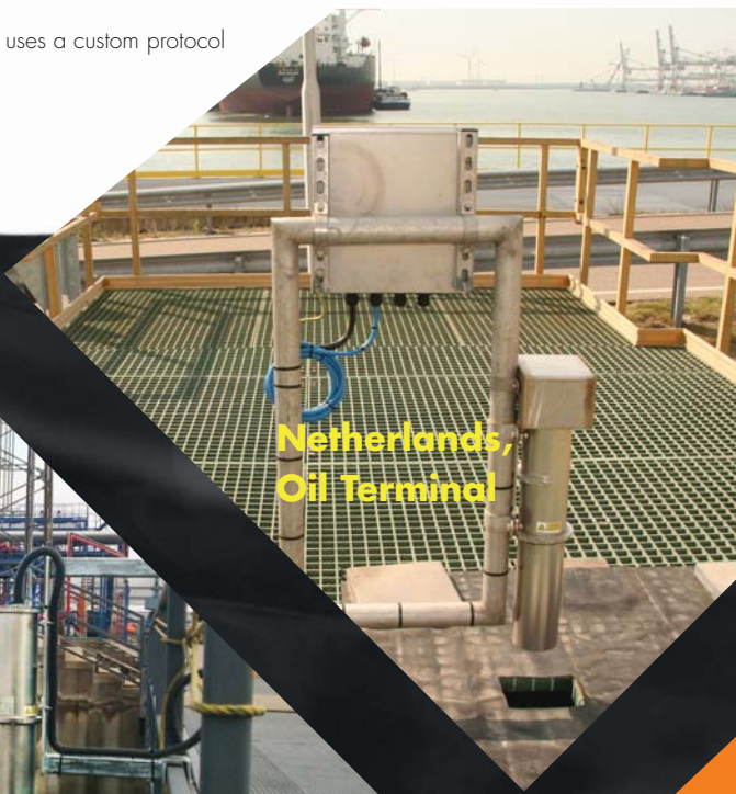
Netherlands, Oil Terminal