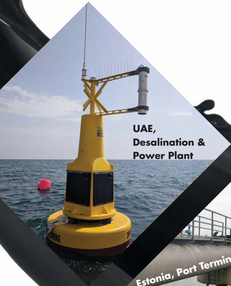
UAE, Desalination & Power Plant