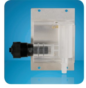
Constant Head Flowcell