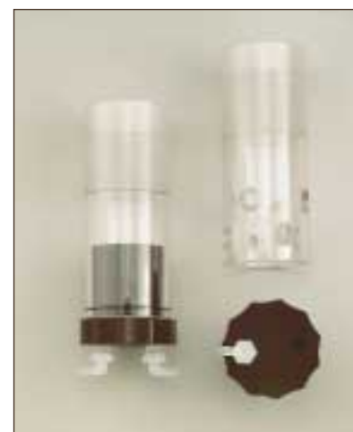
Splash Guard and Flowcell Assembly

Flowcell Assembly: For applications requiring sample draw systems, the flowcell seals the sensing module and permits the addition of inlet and outlet fittings to pipe sample into and out of the sensor.